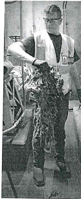
Professionals are working 24/7 at water resource recovery facilities to clean our used water—flushing anything besides the three P's can clog pipes and jam pumps.

WHEN IN DOUBT, DON'T FLUSH – USE THE TRASH CAN!